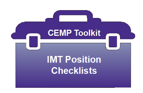
Table 5: Incident Management Team - Facility Position Crosswalk

Table 5 outlines suggested facility positions to fill each of the Incident Management Team positions. The most appropriate individual given the event/incident may fill different roles as needed.